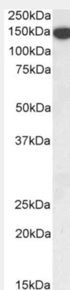
EB09152 (1µg/ml) staining of Mouse Kidney lysate (35µg protein in RIPA buffer). Detected by chemiluminescence.

All products are for RESEARCH USE ONLY. Not for diagnostic & therapeutic purposes!