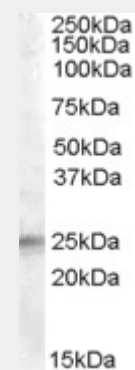
EB08513 (0.5µg/ml) staining of Human Adrenal Gland lysate (35µg protein in RIPA buffer). Primary incubation was 1 hour. Detected by chemiluminescence.

All products are for RESEARCH USE ONLY. Not for diagnostic & therapeutic purposes!