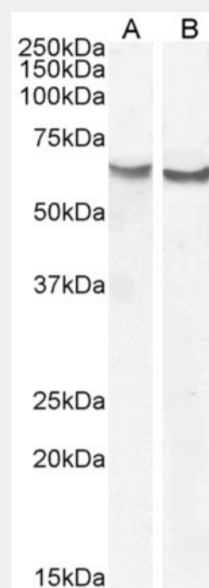
EB08353 (0.03 \mu g/ml) staining of Human Heart (A) and (0.1 \mu g/ml) Placenta (B) lysate (35 \mu g protein in RIPA buffer). Detected by chemiluminescence.

All products are for RESEARCH USE ONLY. Not for diagnostic & therapeutic purposes!