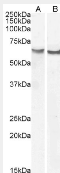
EB08353 (0.03µg/ml) staining of Human Heart (A) and (0.1µg/ml) Placenta (B) lysate (35µg protein in RIPA buffer). Detected by chemiluminescence.

All products are for RESEARCH USE ONLY. Not for diagnostic & therapeutic purposes!