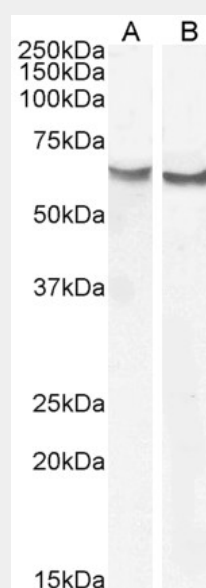
EB08353 (0.03µg/ml) staining of Human Heart (A) and (0.1ug/ml) Placenta (B) lysate (35µg protein in RIPA buffer). Detected by chemiluminescence.

All products are for RESEARCH USE ONLY. Not for diagnostic & therapeutic purposes!