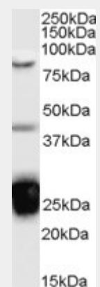
EB07741 (0.1µg/ml) staining of Jurkat cell lysate (35µg protein in RIPA buffer). Detected by chemiluminescence.

All products are for RESEARCH USE ONLY. Not for diagnostic & therapeutic purposes!