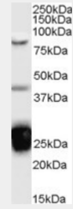
EB07741 (0.1 \mu g/ml) staining of Jurkat cell lysate (35 \mu g protein in RIPA buffer). Detected by chemiluminescence.

All products are for RESEARCH USE ONLY. Not for diagnostic & therapeutic purposes!