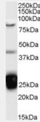
EB07741 (0.1 \mu g/ml) staining of Jurkat cell lysate (35 \mu g protein in RIPA buffer). Detected by chemiluminescence.

All products are for RESEARCH USE ONLY. Not for diagnostic & therapeutic purposes!