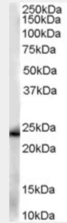
EB06802 (0.01 \mu g/ml) staining of Human Kidney lysate (35 \mu g protein in RIPA buffer). Primary incubation was 1 hour. Detected by chemiluminescence.

All products are for RESEARCH USE ONLY. Not for diagnostic & therapeutic purposes!