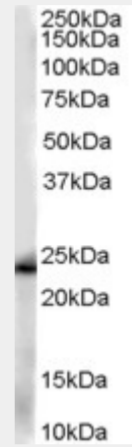
EB06802 (0.01 \mu g/ml) staining of Human Kidney lysate (35 \mu g protein in RIPA buffer). Primary incubation was 1 hour. Detected by chemiluminescence.

All products are for RESEARCH USE ONLY. Not for diagnostic & therapeutic purposes!