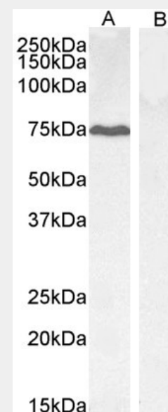
EB05034 (0.3 \mu g/ml) staining of HepG2 (A) and negative control KLY (B) lysate (35 \mu g protein in RIPA buffer) Detected by chemiluminescence.

All products are for RESEARCH USE ONLY. Not for diagnostic & therapeutic purposes!