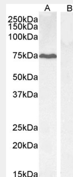
EB05034 (0.3 \mu g/ml) staining of HepG2 (A) and negative control KLY (B) lysate (35 \mu g protein in RIPA buffer) Detected by chemiluminescence.

All products are for RESEARCH USE ONLY. Not for diagnostic & therapeutic purposes!