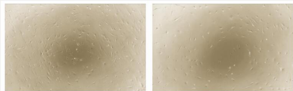
Figure 1. Cell proliferation of 3T3 cells after stimulated with FGF1.

(A) 3T3 cells cultured in DMEM, stimulated with 100ng/mL FGF1 for 48h;