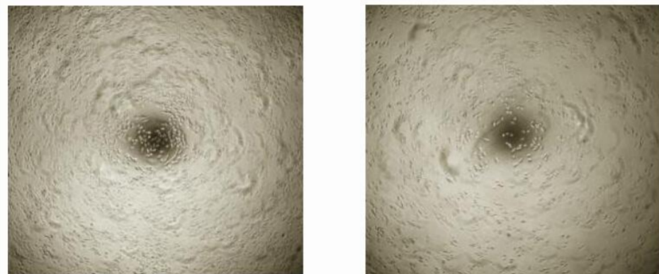
Figure 1. Cell proliferation of MDA-MB-231 cells after stimulated with BMP7.

(A) MCF-7 cells cultured in DMEM, stimulated with 10ng/mL BMP7 for 72h; (B) Unstimulated MDA-MB-231 cells cultured in DMEM for 72h.