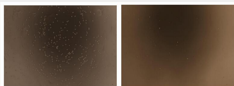
Figure 1. The chemotactic effect of MIP-1-alpha on THP1 cells

(A) THP1 cells were seeded into the upper chambers and serum free RPMI 1640 with 100ng/mL MIP-1a was added in lower chamber, then cells in lower chamber were observed at low magnification ( \times 40 ) after incubation for 5h;